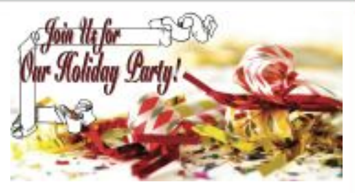
THURSDAY, DEC. 11 DON'T FORGET TO MARK THE DATE ON YOUR CALENDAR.